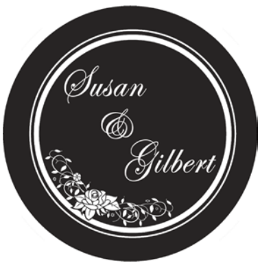
WGT-025 (G) Edwardian Script ITC