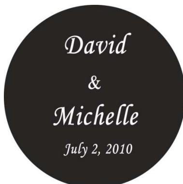
WGT-004 Monotype Corsiva