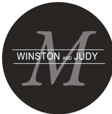
WGT-023 (G) Garamond Premier Pro Arial Regular