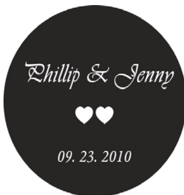
WGT-002 Vivaldi Garamond Premier Pro