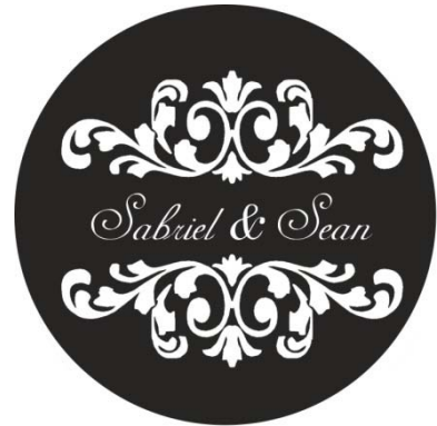
WGT-021 Adine Kirnberg