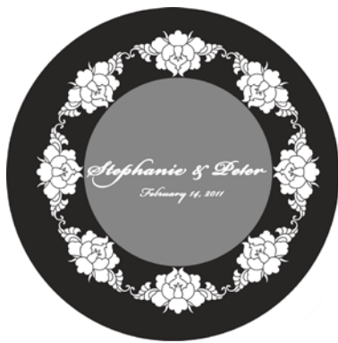
WGT-026 (G) Bickham Script Pro