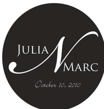
WGT-008 Bickham Script Std Trajan Pro Bickley Script LET