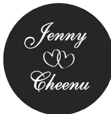
WGT-045 ALS Script