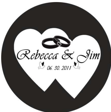
WGT-013 (G) Vivaldi