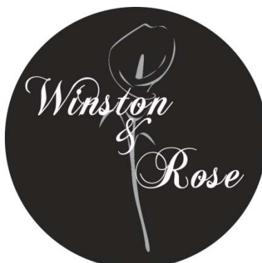
WGT-017 (G) Chopin Script Bickham Script Pro