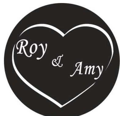
WGT-018 Monotype Corsiva