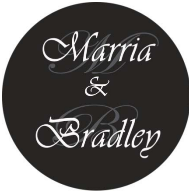
WGT-019 (G) Vivaldi Edwardian Script ITC