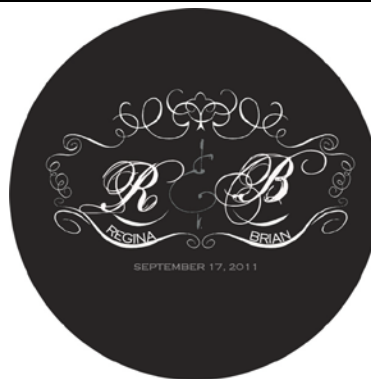
WGT-48 (G) Porcelain Copperplate Gothic Light