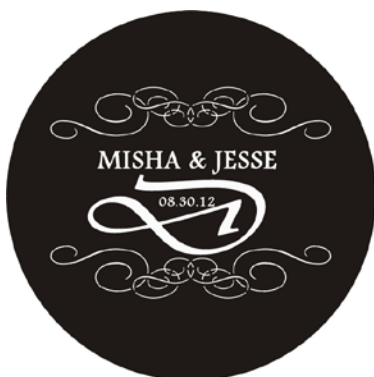
WGT-040 Andalus Vivaldi