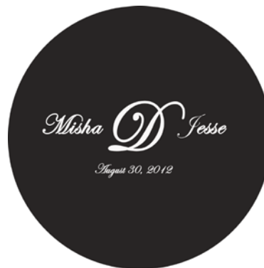
WGT-039 Edwardian Script ITC