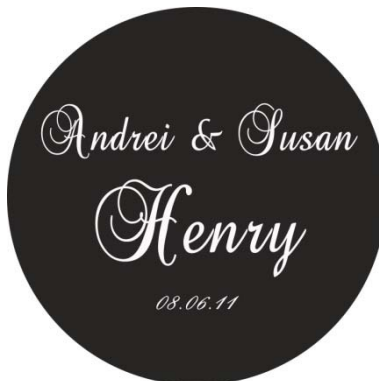
WGT-014 Brock Script Helena Script