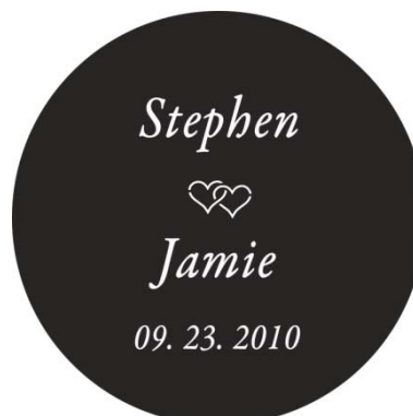
WGT-009 Garamond Premier Pro Bickley Script LET