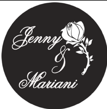
WGT-046 Safron Too