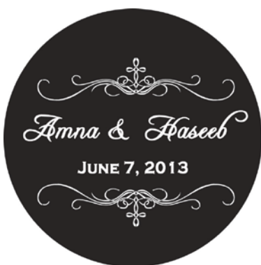
WGT-049 Freebooter Script Copperplate Gothic Bold