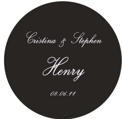
WGT-012 Helena Script (or choose other fonts)