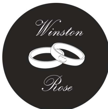
WGT-007 (G) Kunstler Script