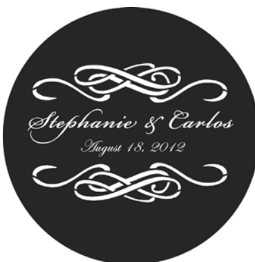
WGT-044 Bickham Script Pro