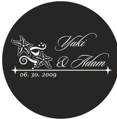
WGT-020 Sloop ScriptThree Lucida Calligraphy