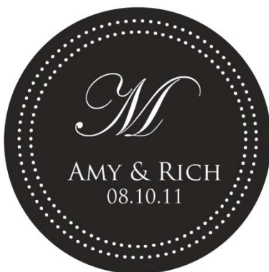
WGT-001 Edwardian Trajan Pro