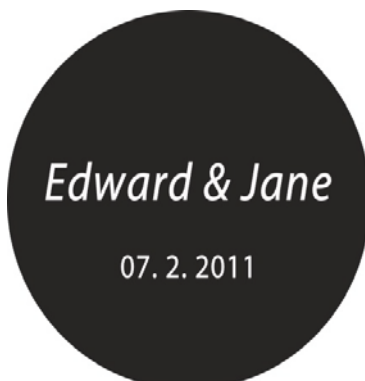
WGT-005 Myriad Pro