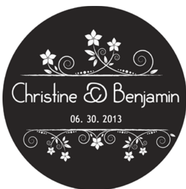
WGT-052 Claritty Trebuchet MS