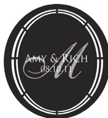
WGT-006 (G) ALS Script Trajan Pro