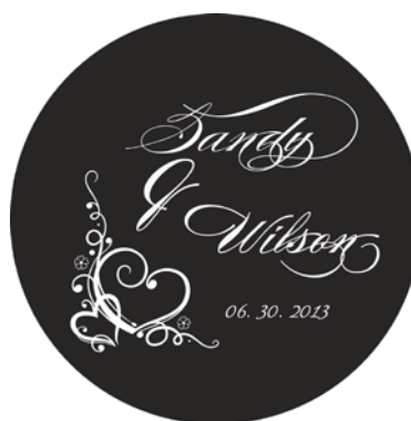
WGT-051 Burgues Script Scriptina