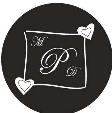
WGT-016 Edwardian Script ITC