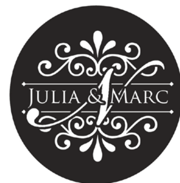
WGT-042 Trajan Pro