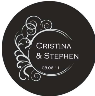
WGT-011 Copperplate Gothic Light