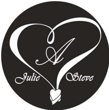
WGT-010 Vivaldi Palace Script MT