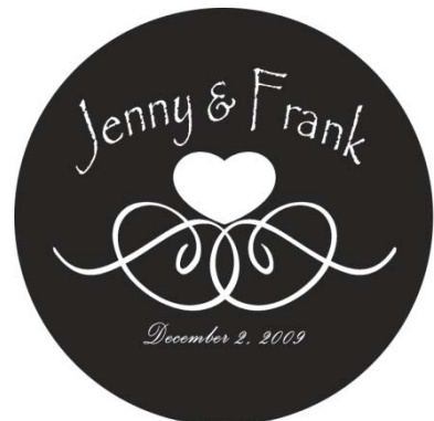
WGT-015 Papyrus Palace Script MT