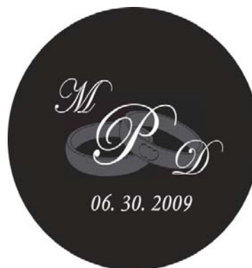
WGT-003 (G) Edwardian Garamond Premier Pro