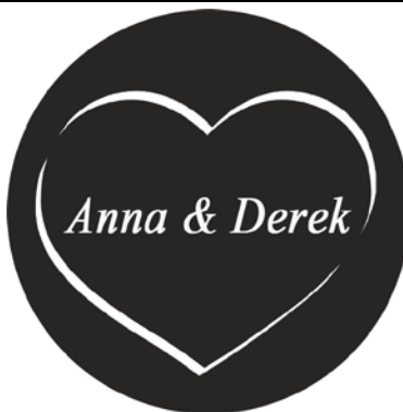
WGT-047 Times New Roman