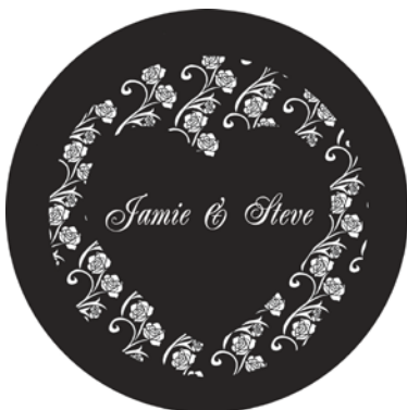
WGT-037 (G) Renaissance